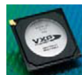
GENNUM® GF9351 VXP™ Chip